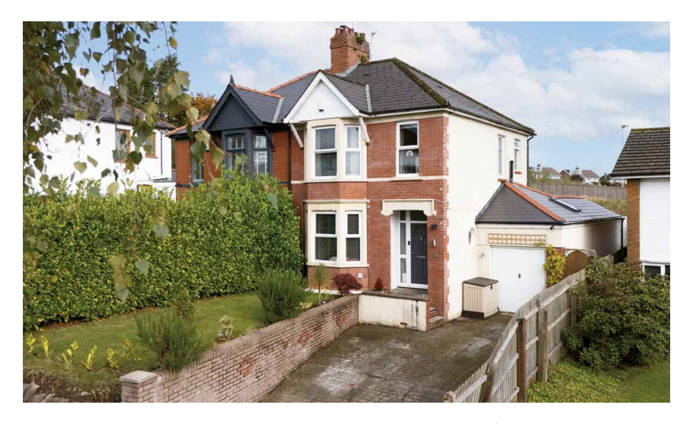
96 Heol Hir Llanishen | Cardiff | CF14 5AD