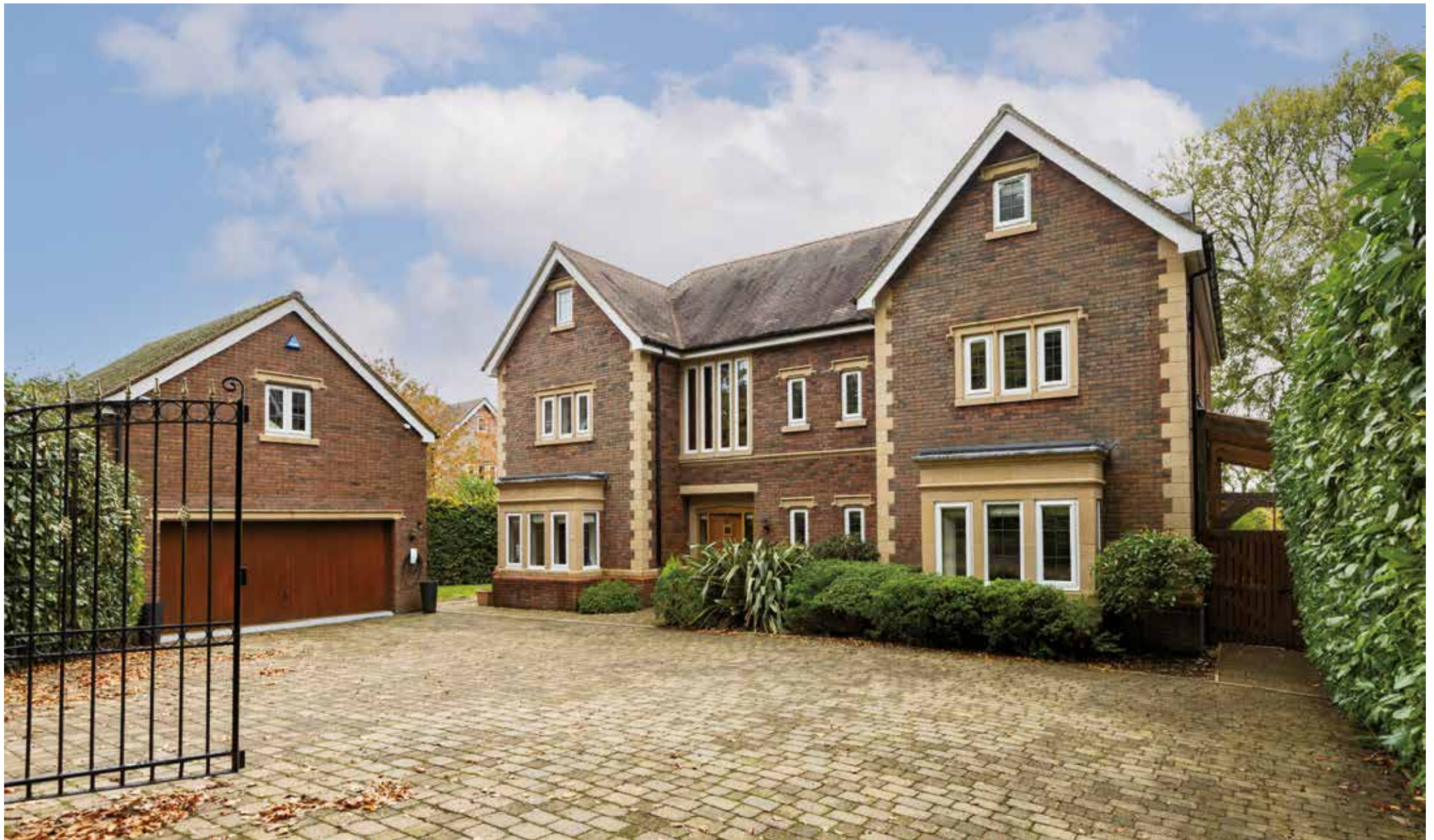
Carew House Druidstone Road | Old St. Mellons | Cardiff | CF3 6XD