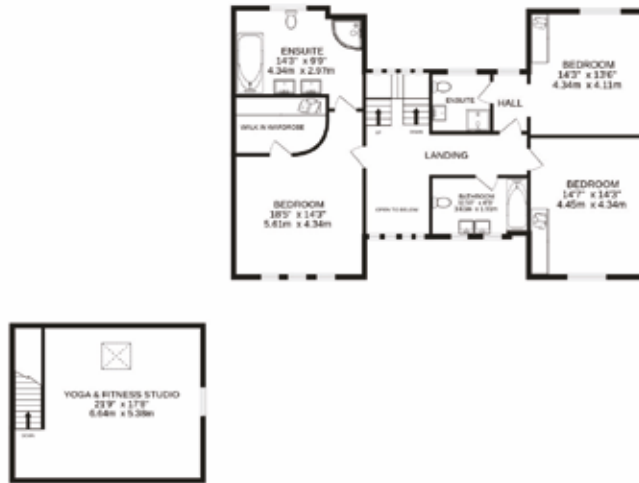
1ST FLOOR 1603 sq.ft. (148.9 sq.m.) approx.