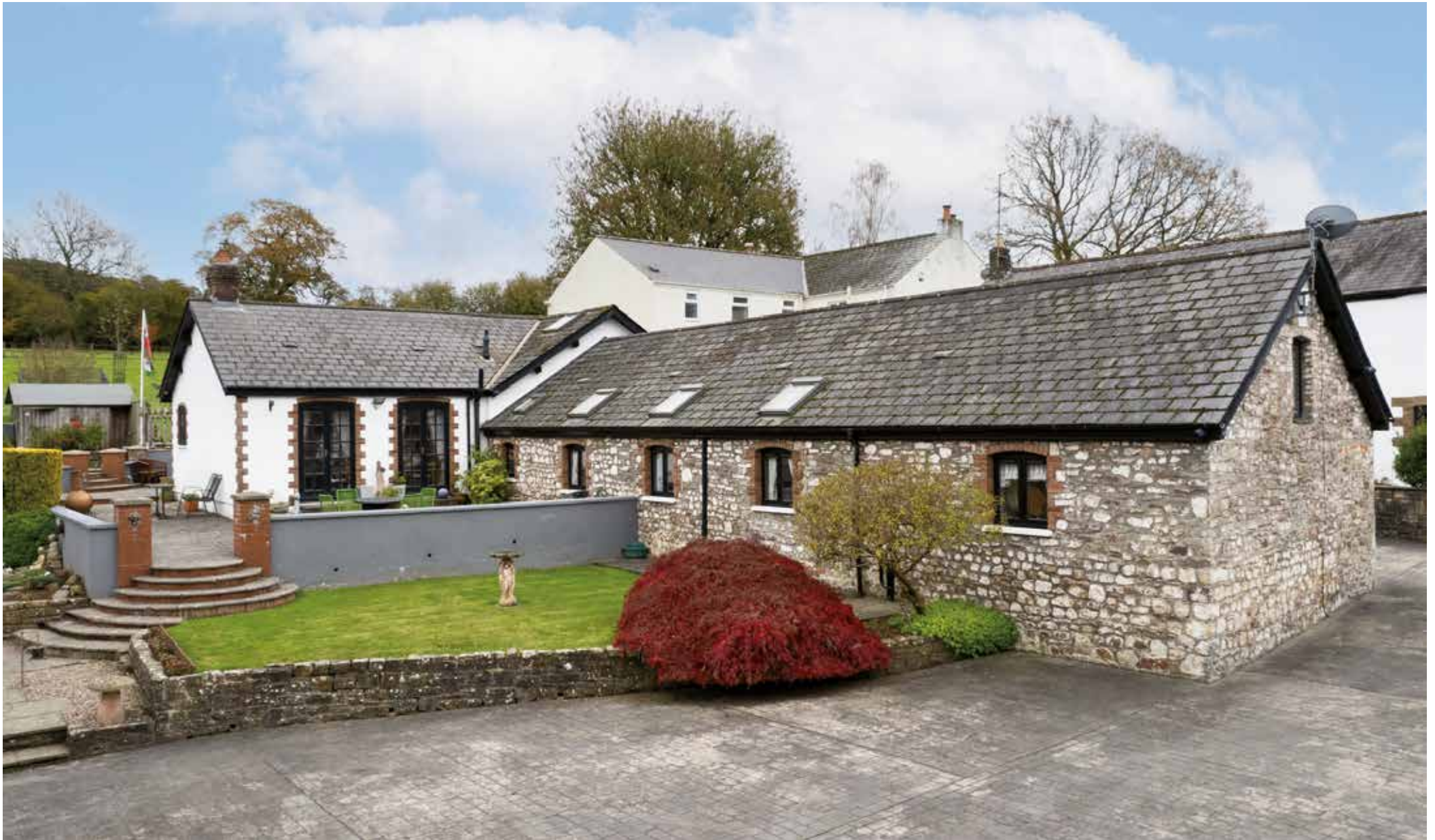
The Lodge Home Farm | Cefn Mably | Cardiff | CF3 6LP