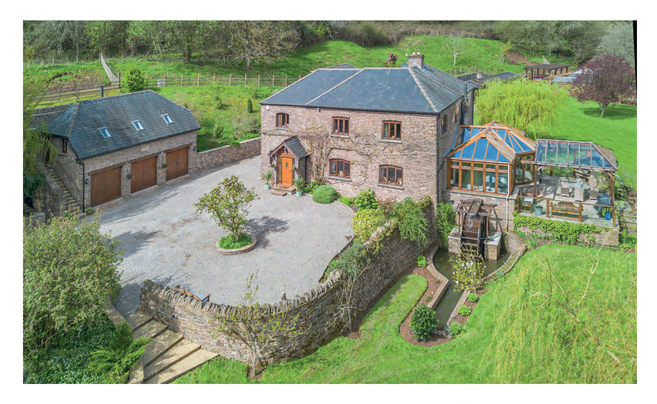
Ruthlin Mill Skenfrith | Abergavenny | Monmouthshire | NP7 8UL