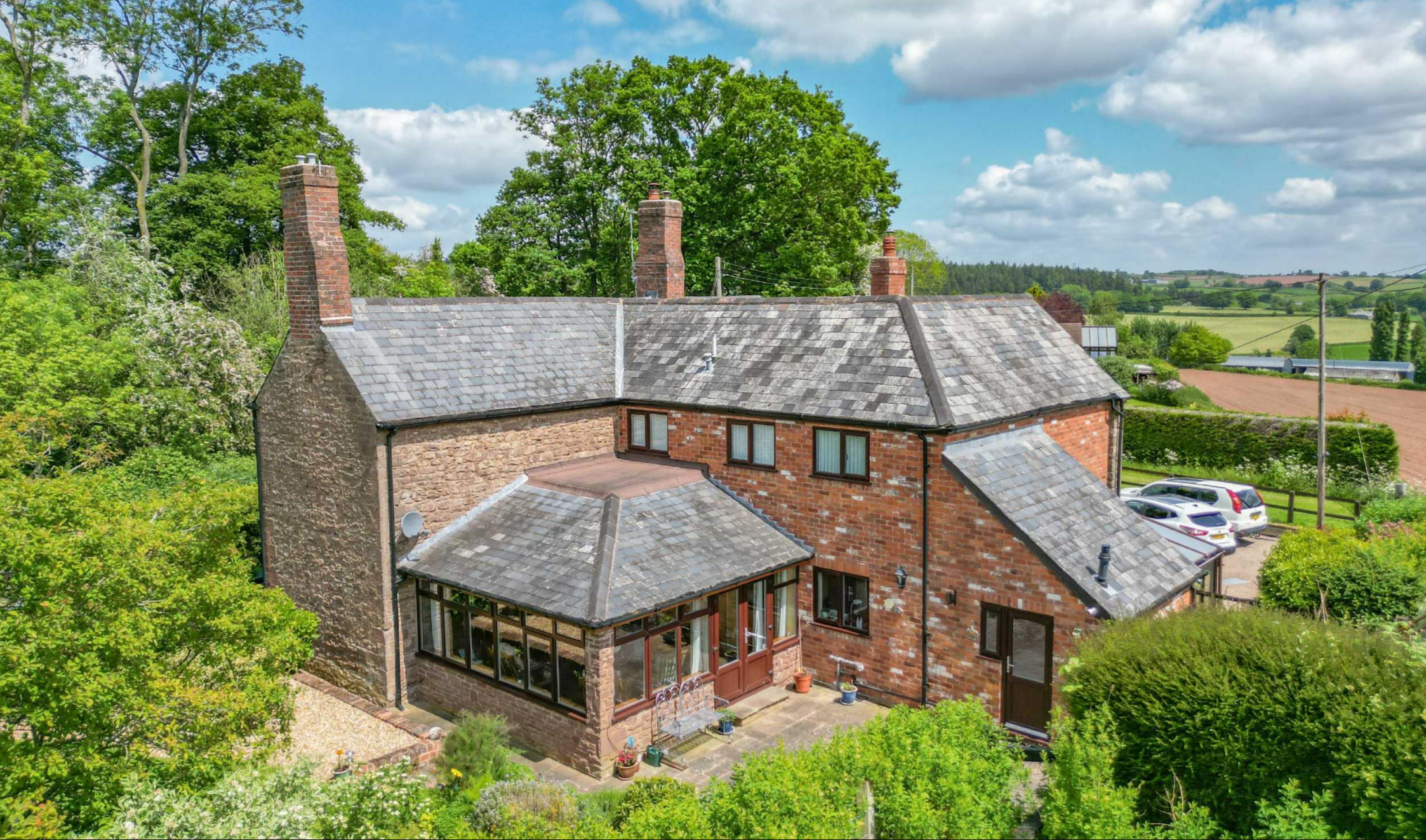
Clay Pitts House Much Birch | Hereford | Herefordshire | HR2 8HX